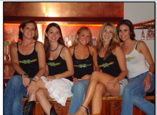
Your favorite Orlando Brewing hostesses celebrate during Earth Day last month.